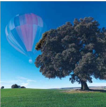
Soft Light: Similar to the "Overlay" mode except lighter.