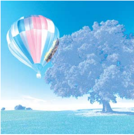
Linear Dodge: Washed out further.