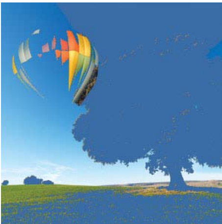
Lighter Color: Removes the darker images within the composition.