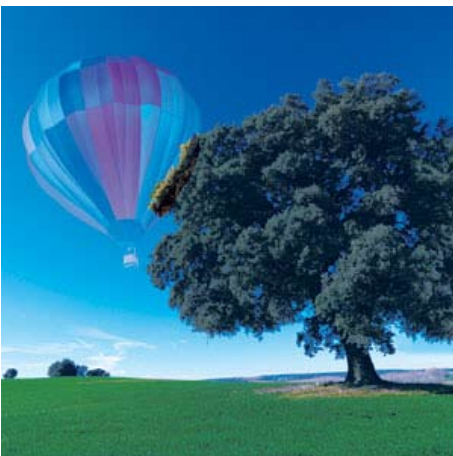
Overlay: The top image is lightly displayed over the image.